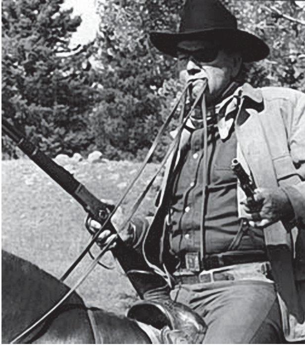
John Wayne in TRUE GRIT

and protocol that remains exemplary in the genre. Hathaway was always a redoubtable pictorialist, serving up unostentatious, deeply gratifying compositions in which action and place are framed to mutual enhancement. He had the eye of a children's storyteller, neither romantic à la John Ford nor expressionistic à la Anthony Mann. Abetted by veteran cinematographer Lucien Ballard (whose foursquare, primary Technicolor images are as satisfying as, if radically distinct from, his dynamic work for Peckinpah that same year), he creates a heart-stirring canvas of the West, from the homely town of Fort Smith – with train station, courthouse, and the gallows in the town square in civilising contiguity – to the trembling aspen forests, picturesque arroyos, and long, deep mountain meadows of the Indian Nation through which the quest of Marshal Rooster Cogburn (Wayne) leads.